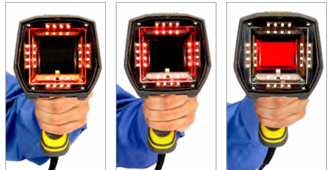
30-, 45-, and 90-degree lighting